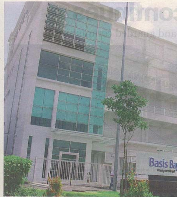
Environment-friendly: The Basis Bay is one of the buildings identified as Green Technology structure in Cyberjaya. (Right): The Hewlett Packard Global IT Campus in Cyberjaya will include extensive open and green areas. Materials, both for the buildings and landscape, are selected for the appropriate solar reflectivity index to reduce the heat island effect. The company is also involved in rain water harvesting for its internal use.

● Air Programmes will be conducted to encourage the community to take part to improve air quality and reduce green house gas (GHG) emissions through energy conservation, and proper disposal of hazardous materials.