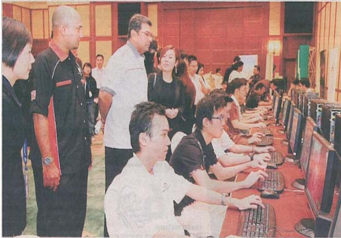
Gamers trying out some of the video games.

For details, call Lucid Events at 03-78745173 or 017-6334308 or visit www.cyberjayaevent.com .