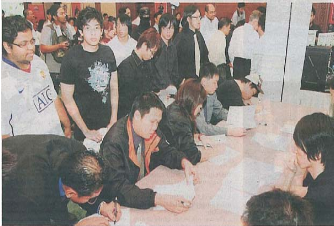
Participants registering for CyberFusion 2009 @ Cyberjaya.