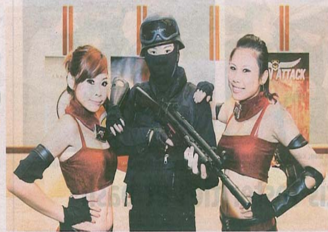
The Ruby Girls and a model dressed as one of the characters from the video game Sudden Attack.