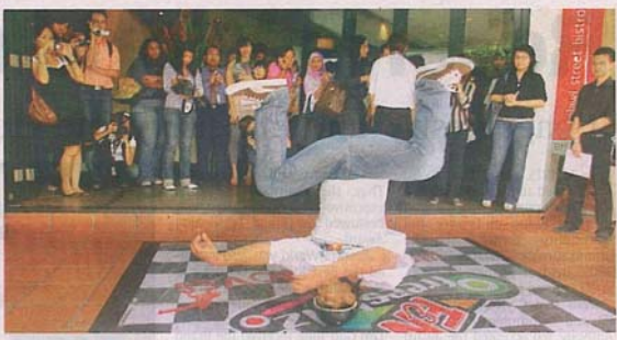
High energy: The Floor Fever Crew showcasing a little of what could be expected from the competitors at the launch of the competition.

The F&N Cruizers will conduct roadshows nationwide in 140 locations to create awareness about the competition.